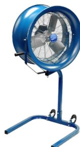
PS Portable Stroller