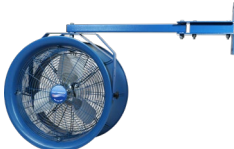
TC Truck Cooler