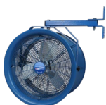
RM Rack Mount